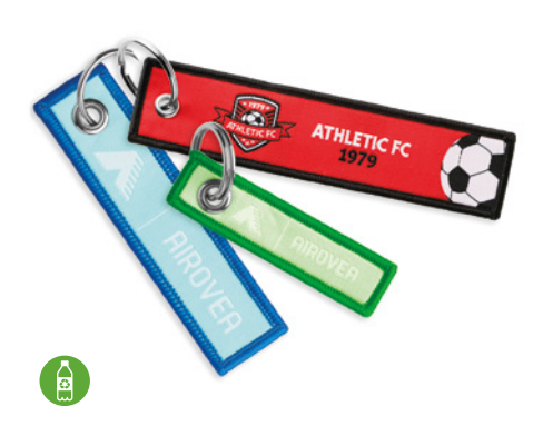
MK2013 Woven key tag. Sizes 13x3 cm / 10x2,5 cm / 6x1,5 cm. Also available in RPET (MK2313).