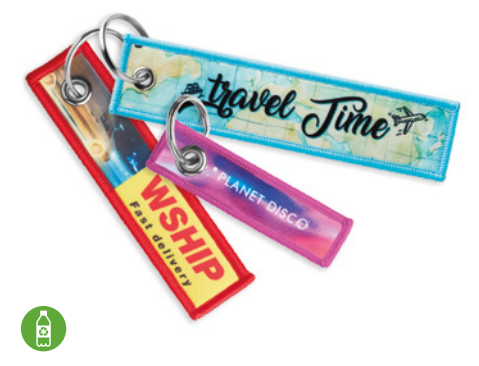
MK2014 Sublimation key tag. Sizes 13x3 cm / 10x2,5 cm / 6x1,5 cm. Also available in RPET (MK2314).