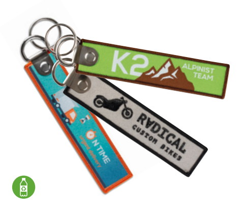
MK2112/13/14 Key tag with double metal ring. Embroidered, Woven or Full colour. Also available in RPET (MK2413/2414).