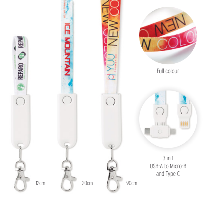
MC1005 Charging Cable lanyard with USB-A to Micro-B (2 in 1 pin) and Type C. Including metal hook. Length: 90, 20 or 12cm.