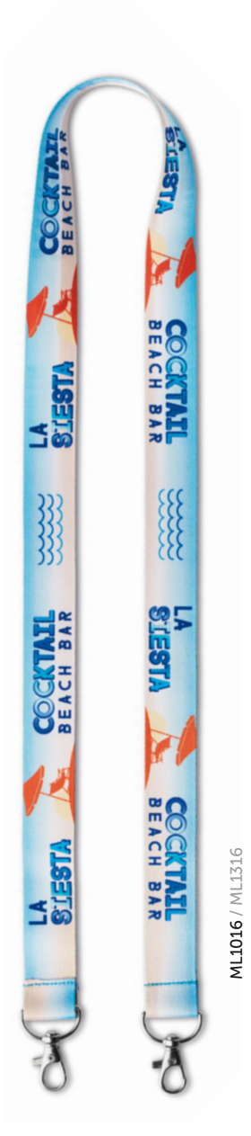
ML1016 Fine Polyester. ML1316 100% RPET.