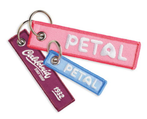
MK2012 Embroidered key tag. Sizes: 13x3 cm / 10x2,5 cm / 6x1,5 cm.