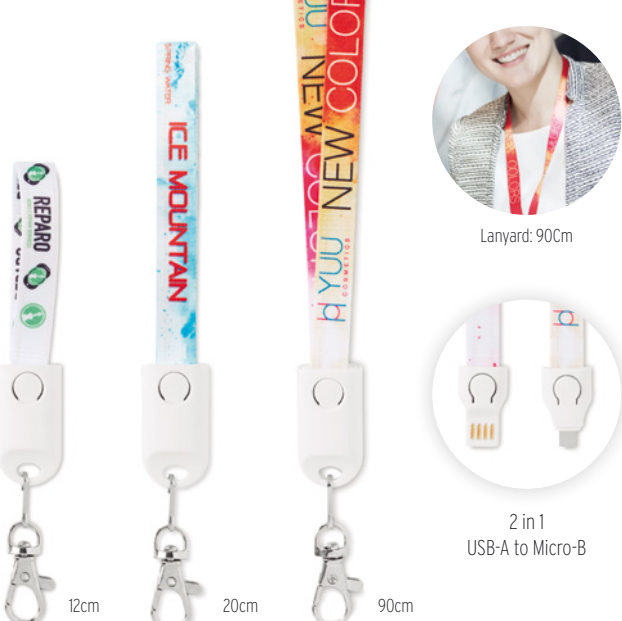
MC1004 Charging cable lanyard with USB-A to Micro-B (2 in 1 pin). Including metal hook. Length: 90, 20 or 12cm.