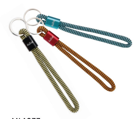
ML1033 Round nylon short strap with engraved buckle.