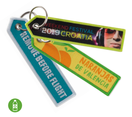
Key tag with triangular shaped end. Embroidered, Woven or Full colour. Also available in RPET (MK2513/2514).