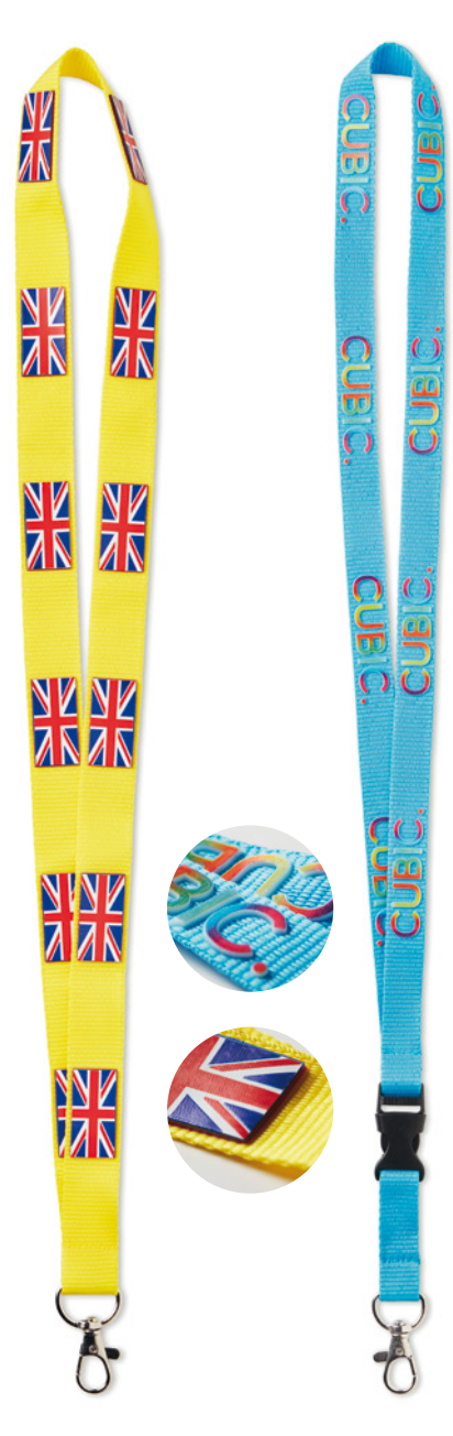
ML1040 Flat Polyester. 3D printed design.