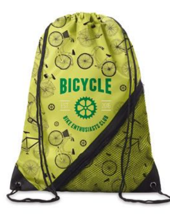
MB3003 Backpack with zipper and mesh pocket.