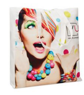
MB8403 Size: 38(w) x 10 (d, side+bottom) x 42(h) cm Long handle 70 x 2.5 cm.