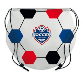
MB3010 Football drawstring bag.