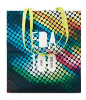
MB8401 Size: 38(w) x 42(h) cm. Long handle 70 x 2 cm.