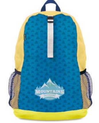
MB1005 Foldable backpack.