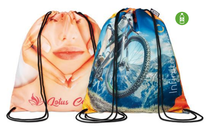
MB3011 Polyester drawstring bag.