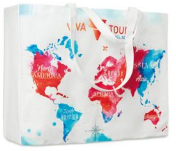
MB8406 Size: 50(w) x 15(d), side+bottom) x 40(h) cm Long handle 70 x 2.5 cm.