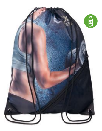
MB3103 100% RPET drawstring bag with zippered polyester mesh pocket