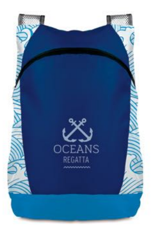
MB1006 Foldable backpack.