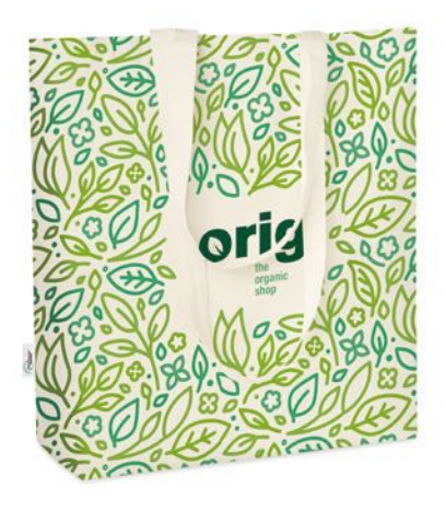
MB8104 Cotton bag with 10cm bottom and long handles (38x10x42cm).