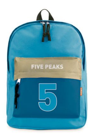
MB4003 Backpack in 600D polyester with outside pocket with zipper. Size: 24x10x31cm.

Backpack in 600D polyester with outside pocket with zipper. Size: 29x11,5x38 cm.