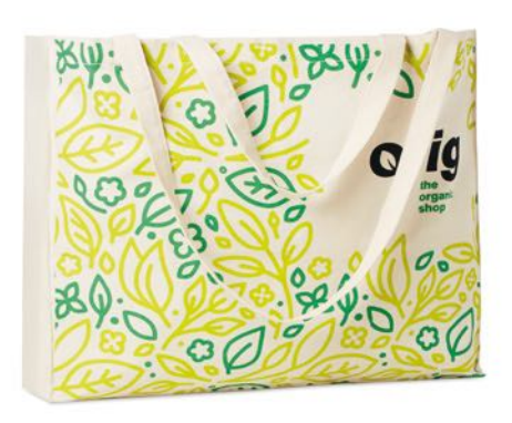
MB8106 Cotton bag with gusset and long handles (50x15x40cm).

Cotton bag with gusset and long handles (38x10x42cm) Long handle 70 x 2.5 cm.