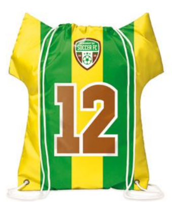
MB3004 Drawstring bag in T-shirt shape.