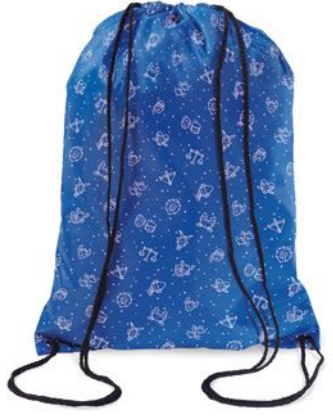
MB3006 Large drawstring bag.