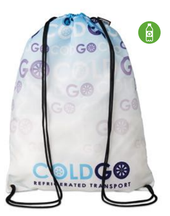
MB3106 Large 100% RPET drawstring bag.