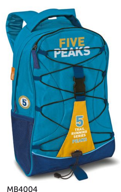
Backpack in 600D polyester. Mesh pockets on both sides. Size: 29x16x46 cm.