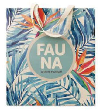
MB8115 Size: 33(w) x 36(h) cm. Short handle 39 x 2 cm. Shoulder strap: 110x2.5cm. Optional: metal buckle to make the strap adjustable.