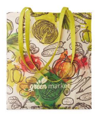
MB8101 (digital) Size: 38(w) x 42(h) cm. Long handle 70 x 2 cm.